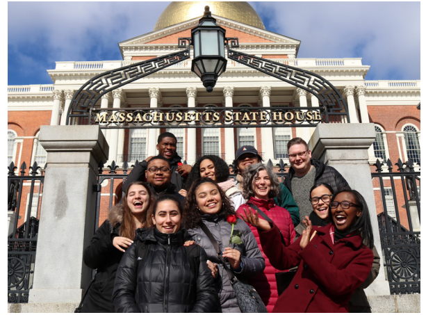
An 826 Boston Young Authors' Book Project brought students to the State House, where they delivered advocacy letters.

“This book is a powerful ode to the power, intelligence, and capacity of young people around us. May their words re-center us to the foundational commitments we owe to one another — and ignite in all of us the courage to turn our ideals into action today.”