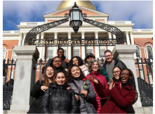
An 826 Boston Young Authors' Book Project brought students to the State House, where they delivered advocacy letters.

“This book is a powerful ode to the power, intelligence, and capacity of young people around us. May their words re-center us to the foundational commitments we owe to one another — and ignite in all of us the courage to turn our ideals into action today.”