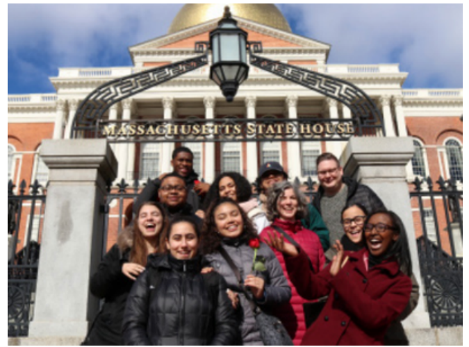
An 826 Boston Young Authors' Book Project brought students to the State House, where they delivered advocacy letters.