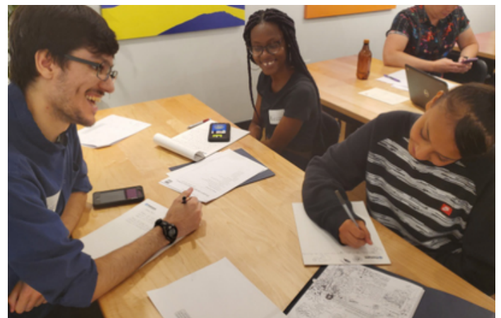
Individualized writing support drives 826 Boston's impact.

91% of published authors reported pride and confidence in their writing.